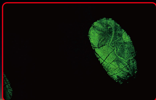
Specific excitation - IR light

Original file photo shot by X-Loupe ForteLite System without retouching