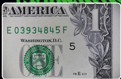
Nomoral light - White Light